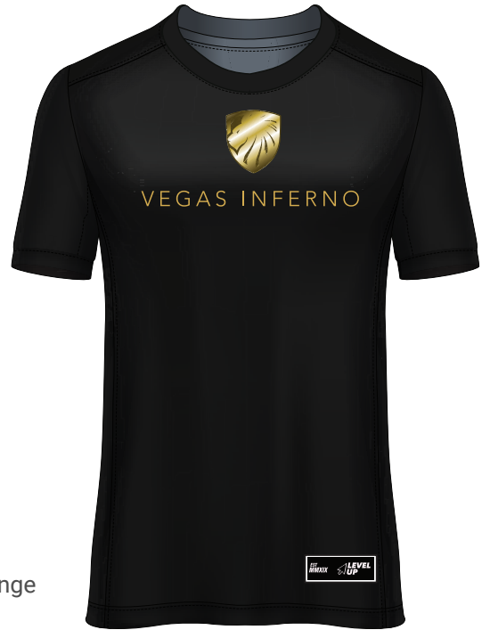
Athletic V neck

Fabric options: 100gsm 200gsm vetilated sport