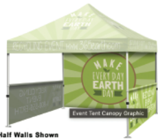
Full and Half Walls Shown (Optional)